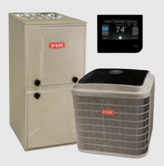
Evolution<sup>™</sup> Extreme<sup>™</sup>: Adaptable speed components for exceptional comfort, precise humidity management, and extra energy efficiency.

Our full array of split-system, forced-air furnaces, air conditioners, heat pumps and coils includes some of the quietest, most energy efficient equipment available. Here are some examples of the innovative technology available in our products: